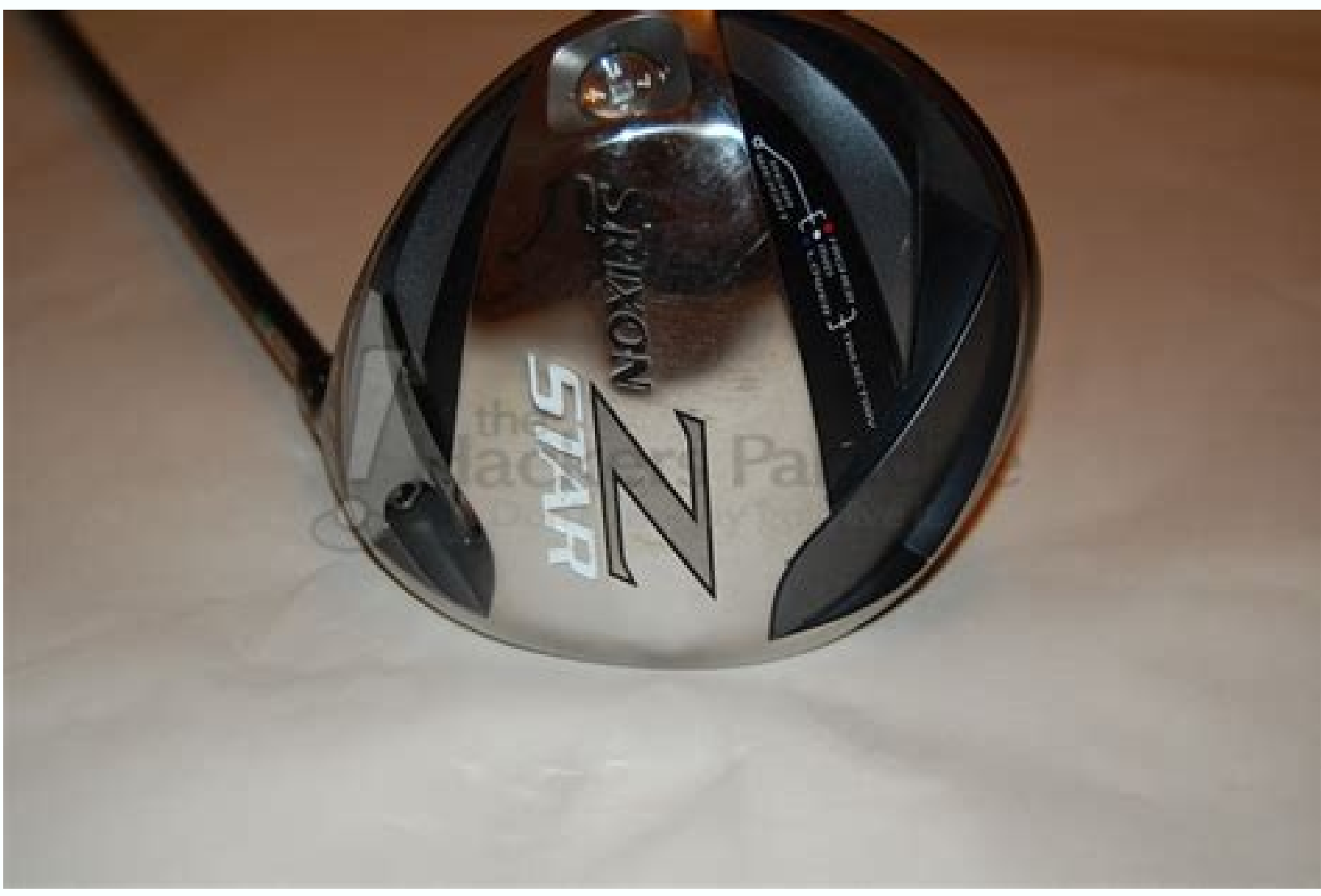
Srixon z star driver